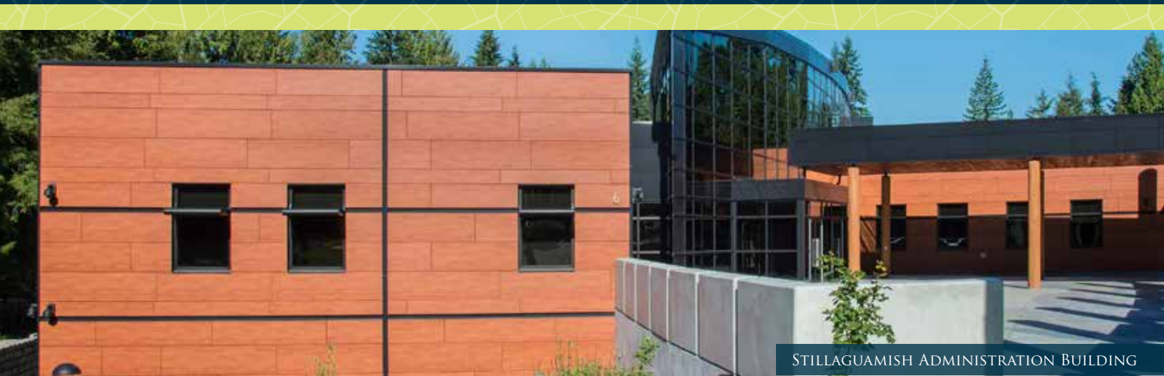
STILLAGUAMISH ADMINISTRATION BUILDING

DIVISION 07-42 SOLID PHENOLIC EXTERIOR CLADDING