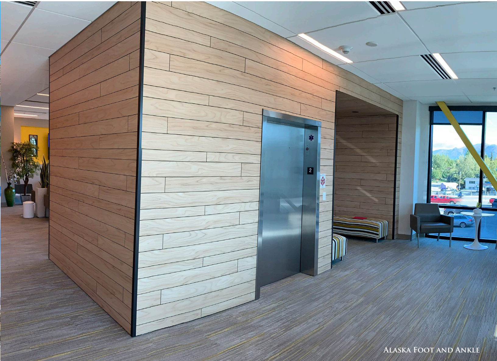
ALASKA FOOT AND ANKLE

With countless features and a vast design offering, Stonewood Architectural Panels forge limitless expressions. Add design flair and create spaces that inspire with Stonewood's sophisticated, clean, and durable Interior Panels.