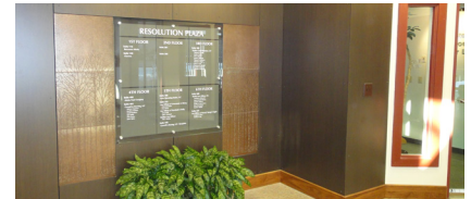
Resolution Plaza | Anchorage

Stonewood Architectural Panels offer remarkable design flexibility in both interior and exterior applications. Resolution Plaza created a rich, beautiful atmosphere for the commercial office space using Stonewood Interior Panels in an exquisite Xanadu color. Stonewood was specifically chosen for this project due to the panels' unique customizability and durable, attractive interior wall protection.