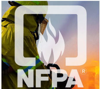
Stonewood panels are NFPA 285 compliant.