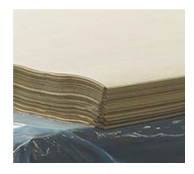
Kraft paper is the major component.