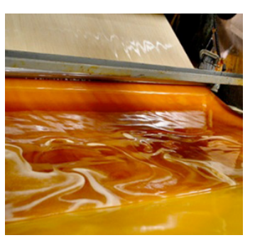
Phenolic resin and a decorative layer are added.