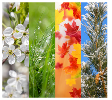
Panels tolerate all climates.