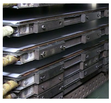
The "paper sandwich" is cured under heat and pressure.