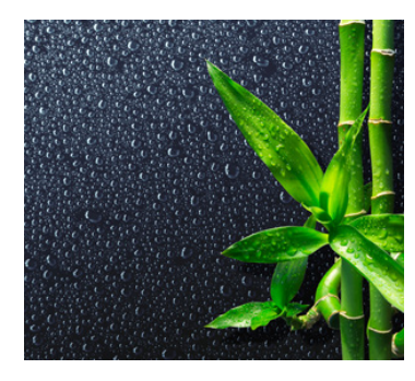
Impervious to moisture, graffiti, and bacteria.

The result is a highly durable and nonporous wall covering or cladding.