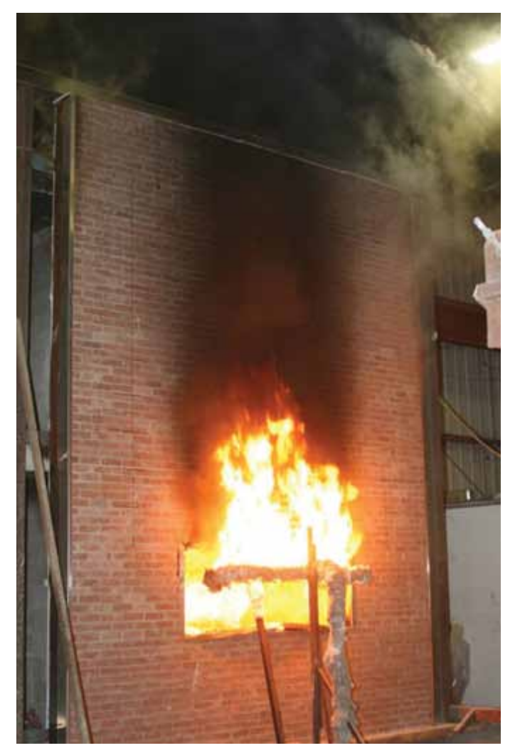
Figure 2. An NFPA 285 test in progress.

Several important points concerning the applicability and use of test results must be emphasized: