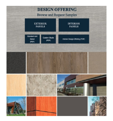
Review and Explore Online