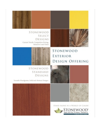
Exterior Design Offering