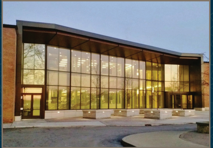
Stonewood Architectural Exterior Panels were used to create a stunning natural wood aesthetic. Stonewood Panels are proudly Manufactured in America with a short 3-week production lead time. Project design is by Bialosky + Partners Architects.

Opened in the fall of 2012, the new 37,580 sq. ft. Culinary Arts & Convergent Digital Arts Joint Facility at Lorain County Community College houses three teaching kitchens, a dining lab, multi-use spaces, and much more. The project used Stonewood Architectural Panels to carry the stunning, natural wood aesthetic from the exterior soffit into the interior ceiling over the main entry and monumental staircase. This project is seeking LEED certification and has received a 2013 Honorable Mention Award from the Cleveland Chapter of the American Institute of Architects for Achievement of Excellence in Architectural Design .