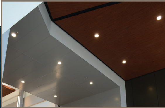
Stonewood Architectural Interior Panels were used on the interior ceiling over the main entry and monumental staircase. Stonewood Architectural Panels are available in a wide selection of colors and unique designs.

Ben and Jane Norton Culinary Arts Center at Lorain County Community College | Elyria, OH Institutional Building